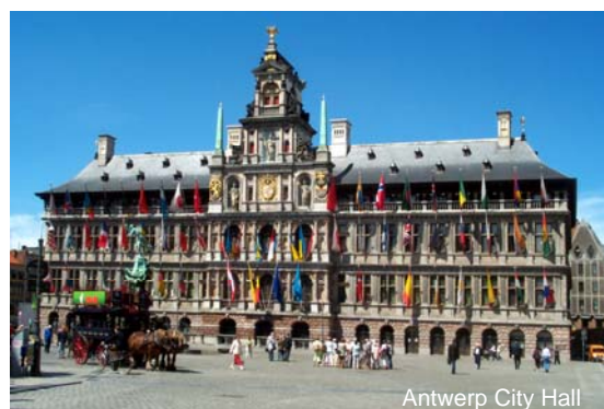
Antwerp City Hall

Should there be additional participants, a reservation will be made in a nice restaurant in the centre of Antwerp.